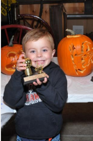
1 st place for Scariest!